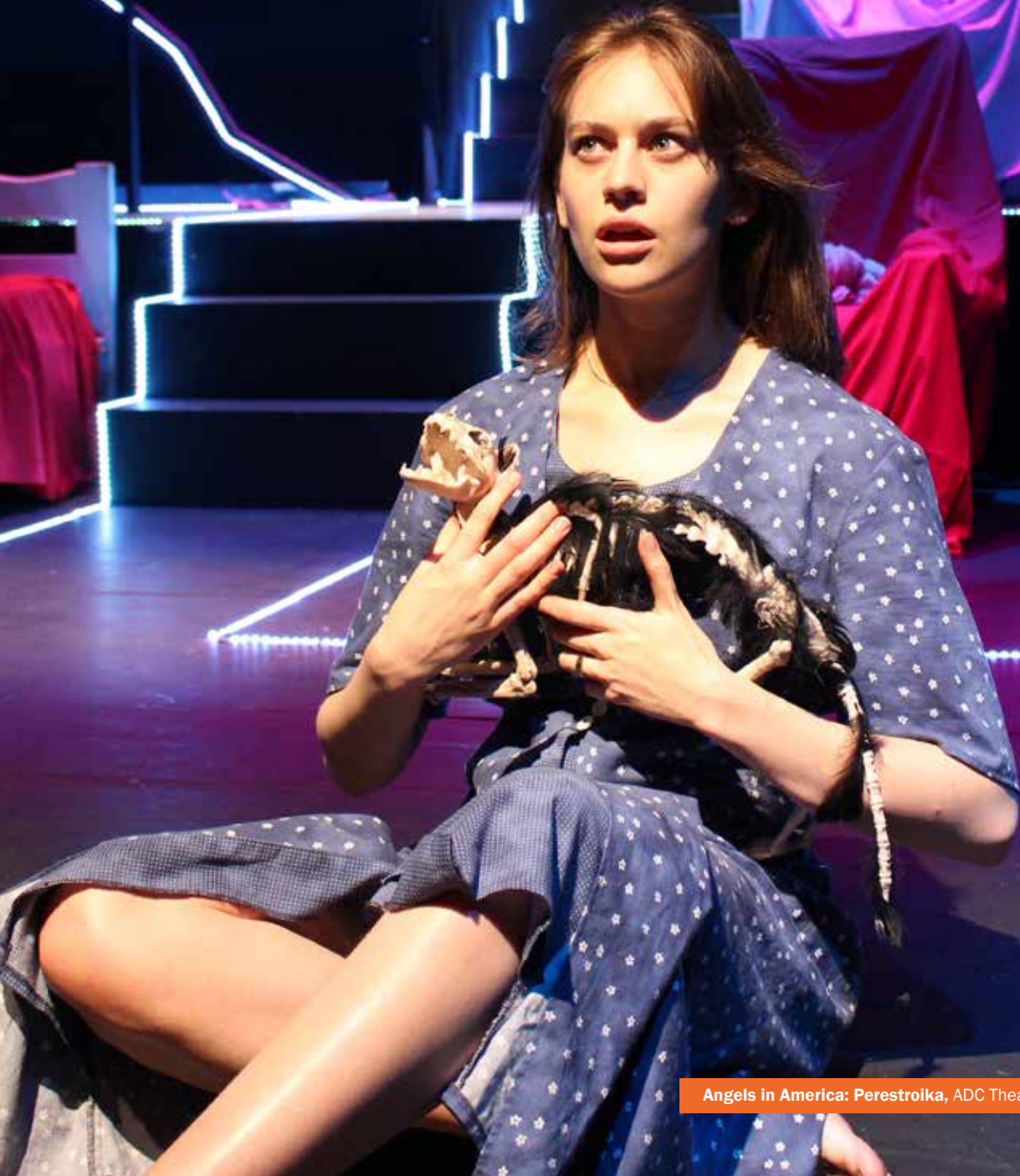
Angels in America: Perestroika, ADC Theatre