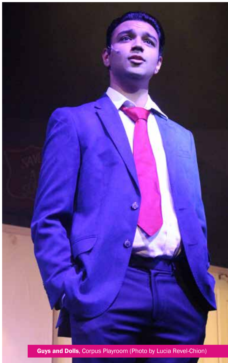
Guys and Dolls , Corpus Playroom