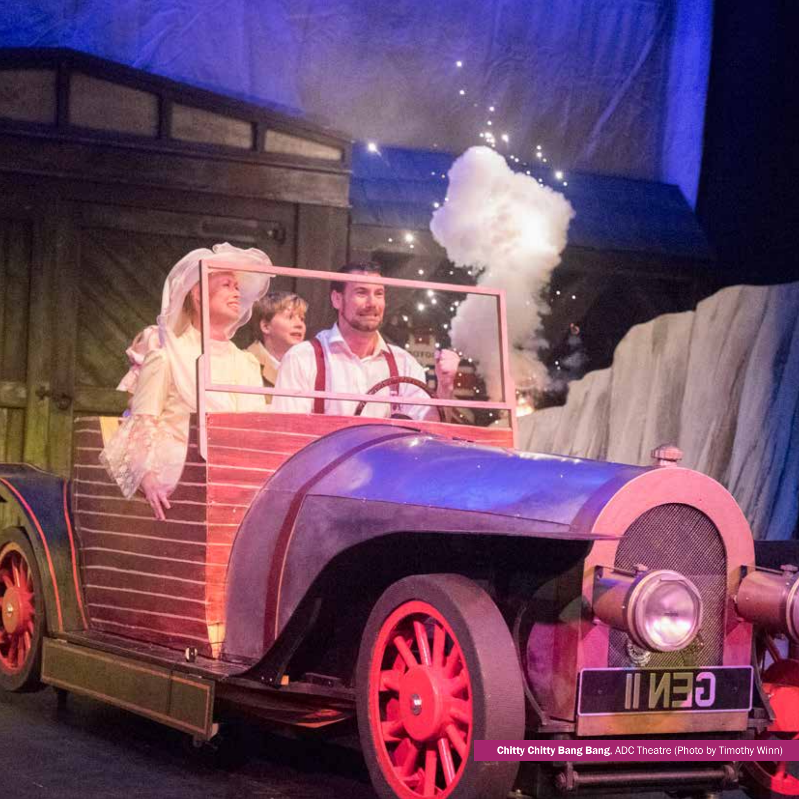
Chitty Chitty Bang Bang, ADC Theatre