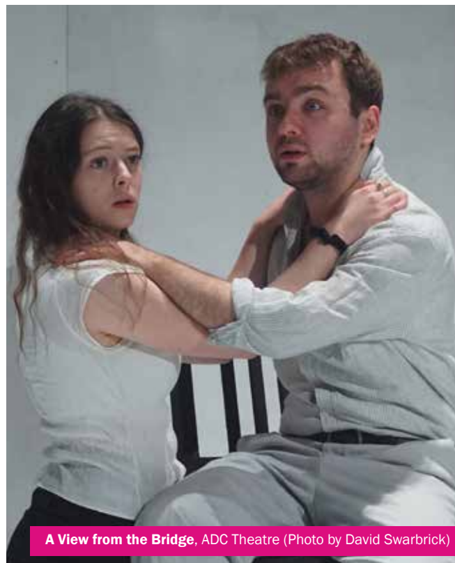
A View from the Bridge, ADC Theatre