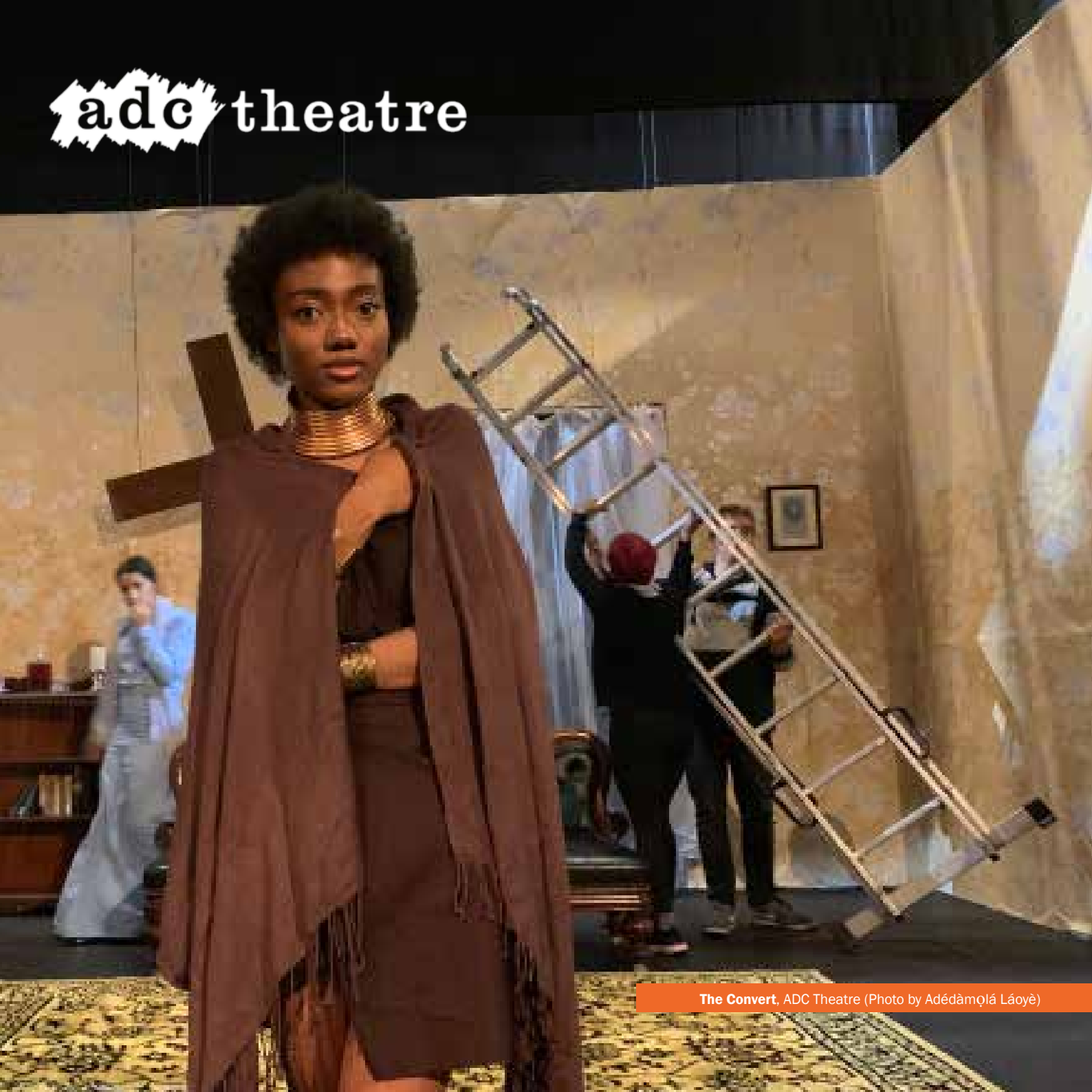
The Convert, ADC Theatre