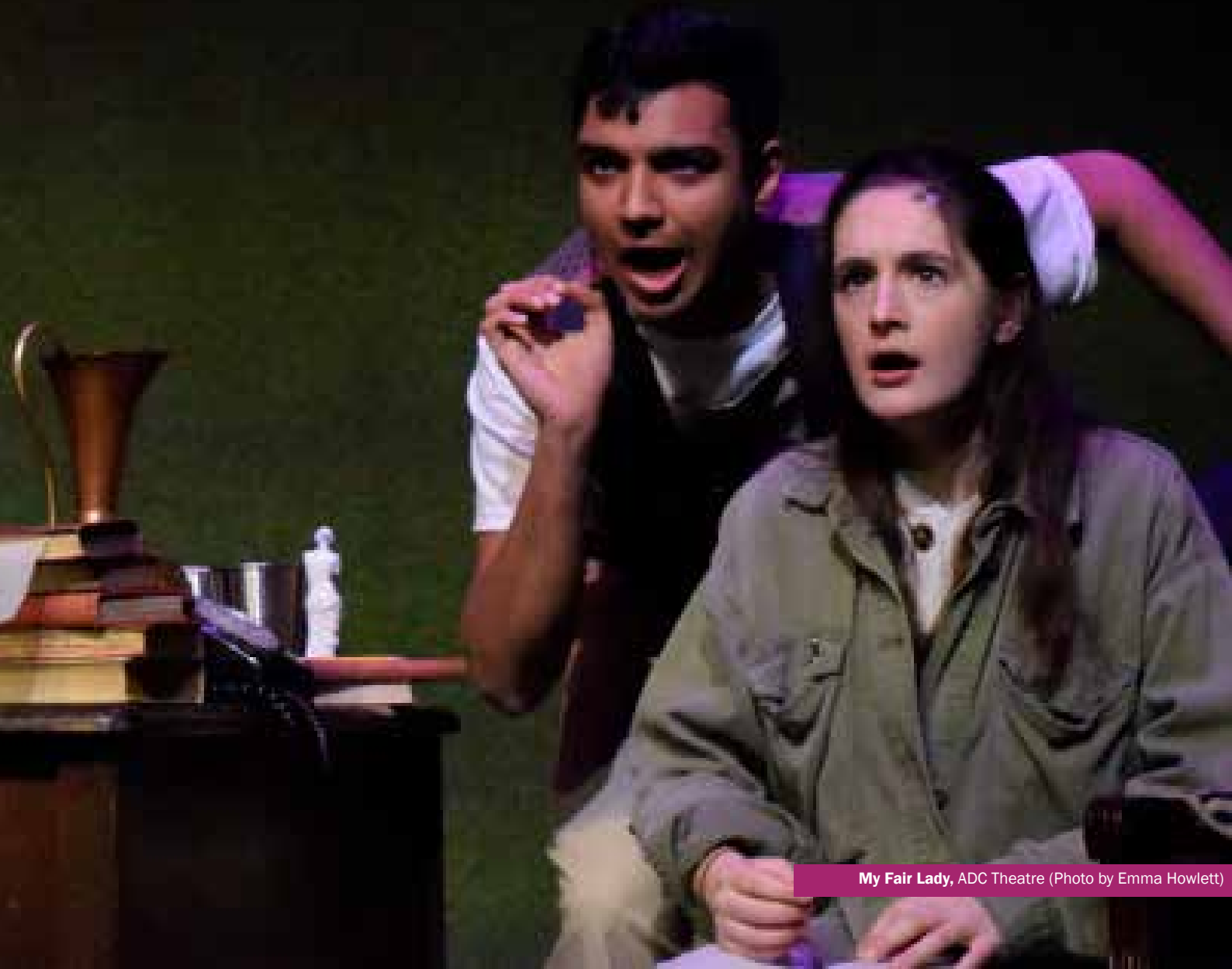
My Fair Lady, ADC Theatre